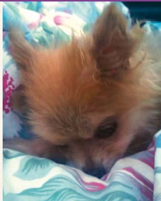
Gidget resting after surgery

Gidget recently underwent extensive surgery, having both back legs operated on and 13 rotted teeth removed. She is recouping nicely and will start physical therapy soon but LOVE has made the greatest difference for these pups!